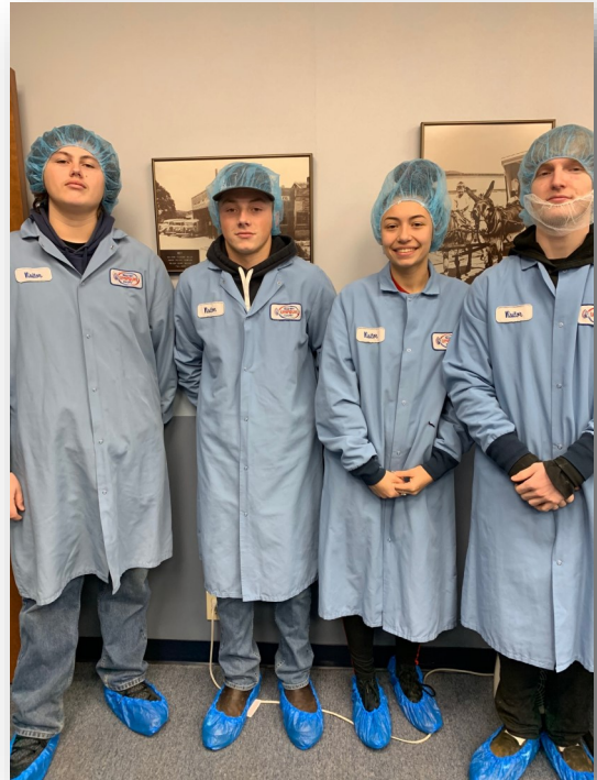
Students all dressed up for the tour of Umpqua Dairy.

The purpose of the tours is to give a taste of what's available in the job market to those students that just are not interested in college. This used to be the majority of jobs in the job market, but today, that is not true. Hundreds of thousands of skilled workers are leaving the workforce, leaving openings that cannot be filled. Perhaps this will spark a few students and get them into a career.